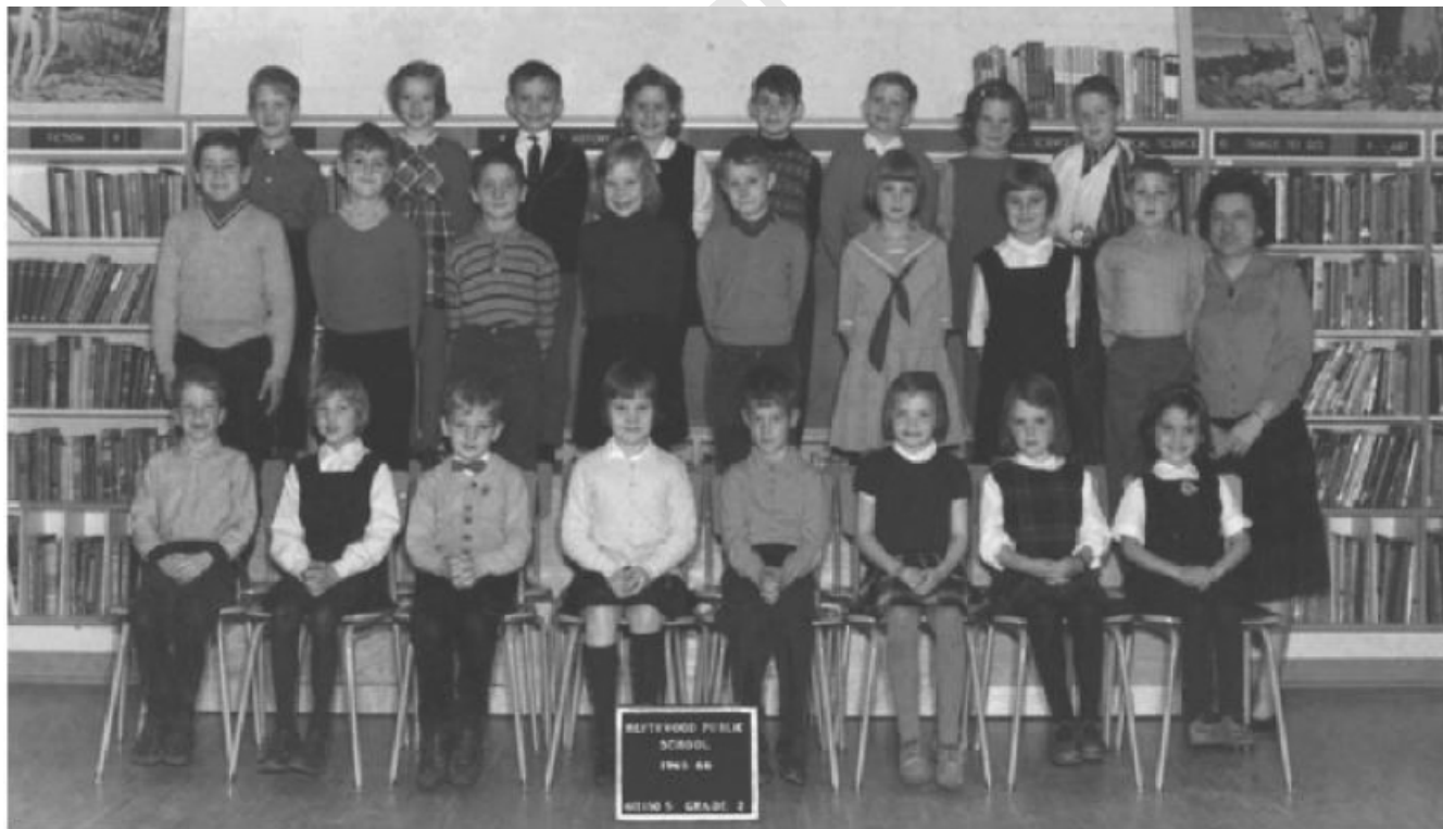
Fig. 1. Example of the sort of school-class group photos used in the experiment. Note that this example, being the photo of the first author's Grade 2 class, is of somewhat older vintage than those used in the experiment, and that the original of the example and the photos used in the study were in color.