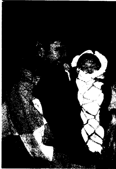
Onion Lake program graduate with her son on a cradle board